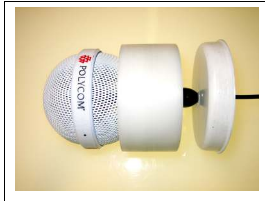
Microphone – Slide / Magnet carrier / dust cap